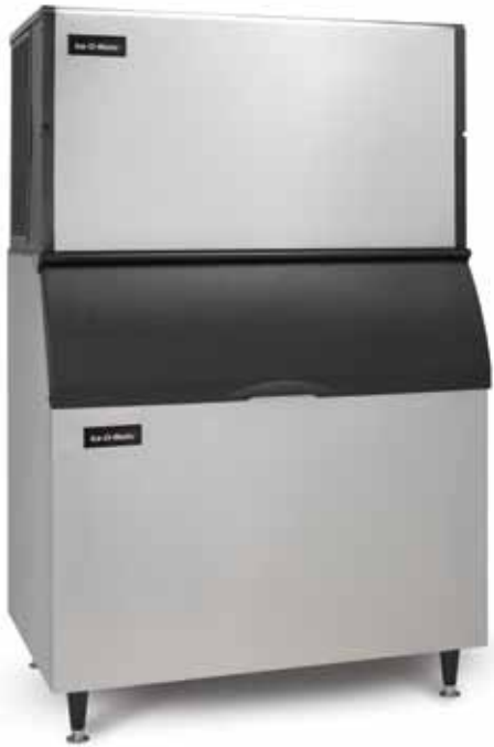
ICE2106 ON B100