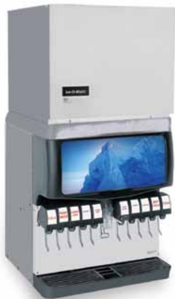
ICE1506 ON A DISPENSER